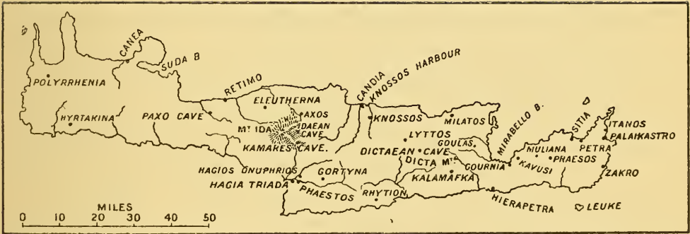
SKETCH MAP OF CRETE